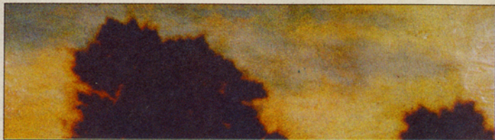
Untitled landscape by Monique Motiff.

"Playing off the functionality of tools, instruments and toys, Rebuilt Domestic Devices are idiosyncratic objects that record and discover their own making," Townsend said. "Parts are often transplanted, left behind or recycled. Viewers can see that my objects